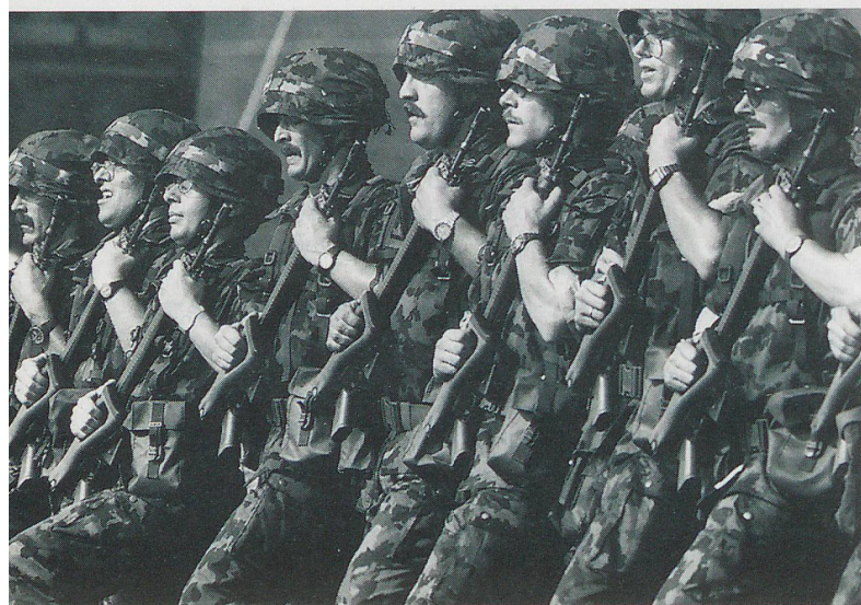
The Army '95 concept includes a careful combination of work...