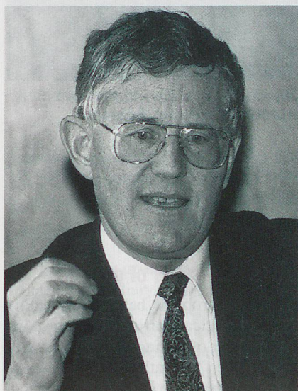
Kaspar Villiger: "The world has not become a safer place".