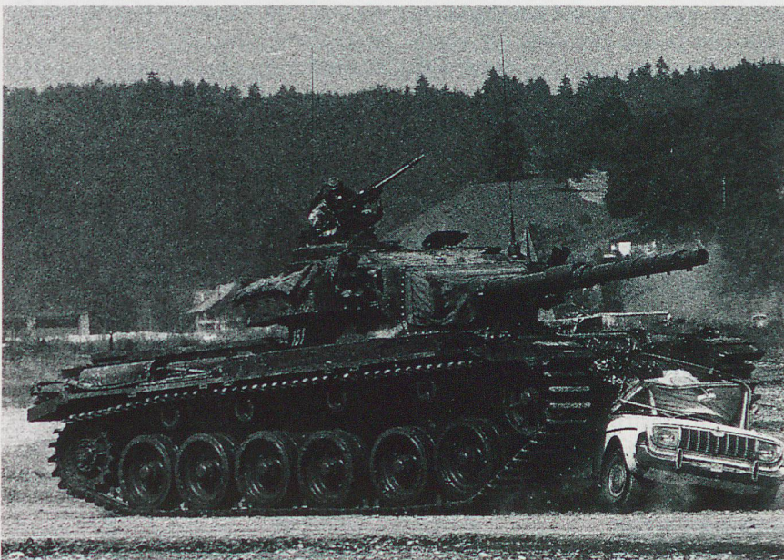
For increased flexibility: the three mechanised divisions will be turned into five tank brigades.