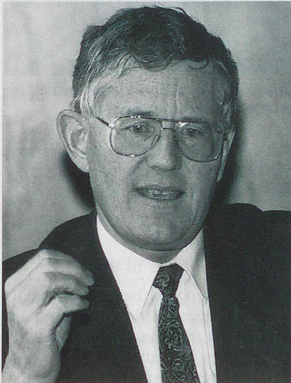
Kaspar Villiger: "The world has not become a safer place".