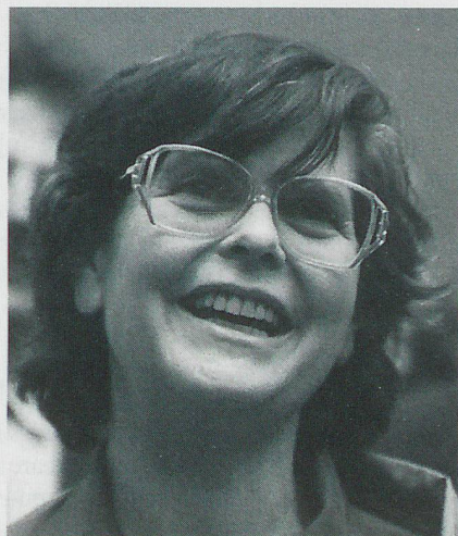
and his successor, Ruth Dreifuss

Ruth Dreifuss is the 100 th member of the Federal Council and succeeds René Felber. She is the second-ever woman member of the federal executive and was chosen after Francis Matthey announced that he could not accept election.