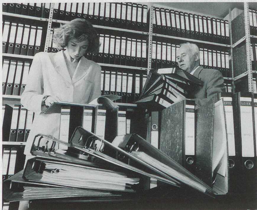
Career-oriented women between two fronts: either to be as professional as their husbands or, if they succeed, not to be real women.

When a woman plans her life nowadays, a job is usually included. Indeed it is a condition for her future independence. But much less automatic is the opportunity for qualified training leading to a job with chances of promotion. It is certainly true that more girls now take part in the first stage of non-compulsory education, higher secondary school, but that in itself does not mean that they have better opportunities of climbing the professional ladder. This depends on too many other factors, for example