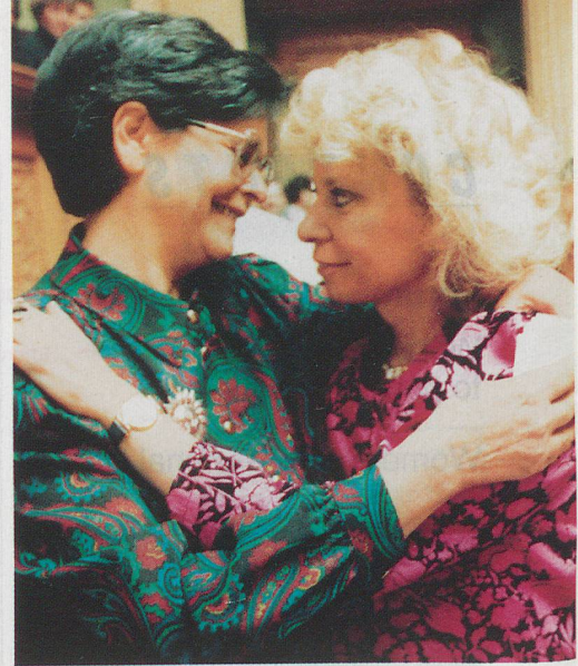
Christiane Brunner (left) congratulates her «political twin», Ruth Dreifuss, on her election to the Federal Council.

More than 20 years after Swiss women finally got the vote, one of the seven seats on the Federal Council is occupied – for the second time – by a woman. The entry of socialist Ruth Dreifuss into the federal executive is a milestone in the slow march by women towards political power. For the first time this has reached the very centre of the political process.