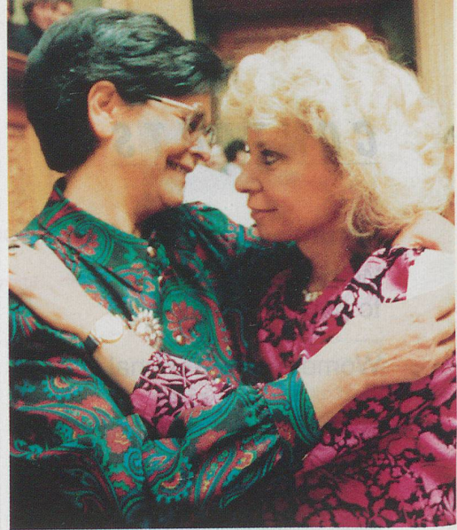
Christiane Brunner (left) congratulates her «political twin», Ruth Dreifuss, on her election to the Federal Council.

More than 20 years after Swiss women finally got the vote, one of the seven seats on the Federal Council is occupied – for the second time – by a woman. The entry of socialist Ruth Dreifuss into the federal executive is a milestone in the slow march by women towards political power. For the first time this has reached the very centre of the political process.