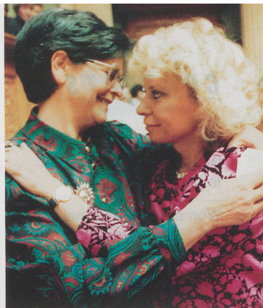
Christiane Brunner (left) congratulates her «political twin», Ruth Dreifuss, on her election to the Federal Council.

More than 20 years after Swiss women finally got the vote, one of the seven seats on the Federal Council is occupied – for the second time – by a woman. The entry of socialist Ruth Dreifuss into the federal executive is a milestone in the slow march by women towards political power. For the first time this has reached the very centre of the political process.