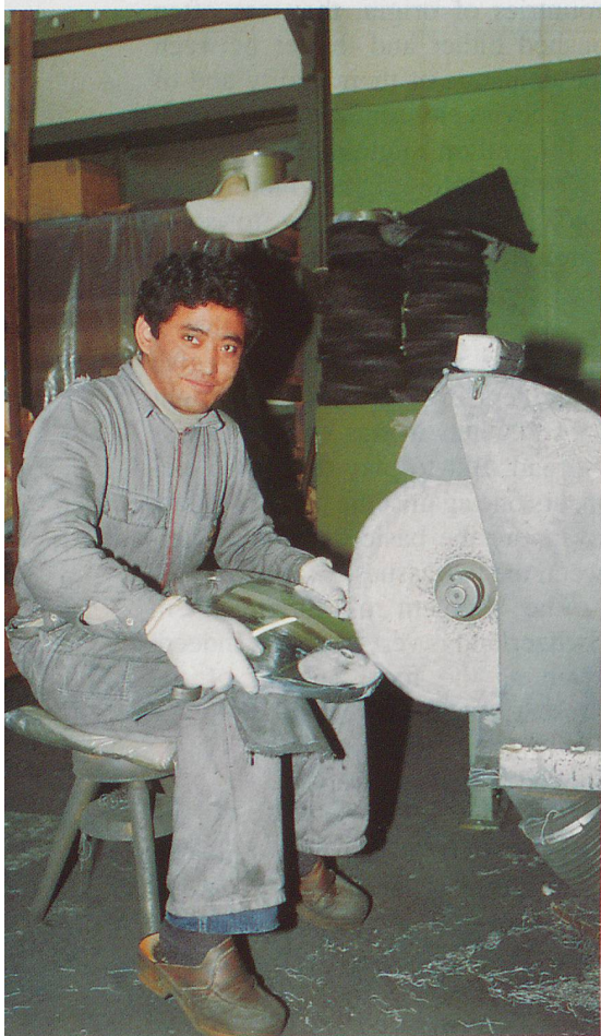
Without foreigners whole economic branches would collapse.