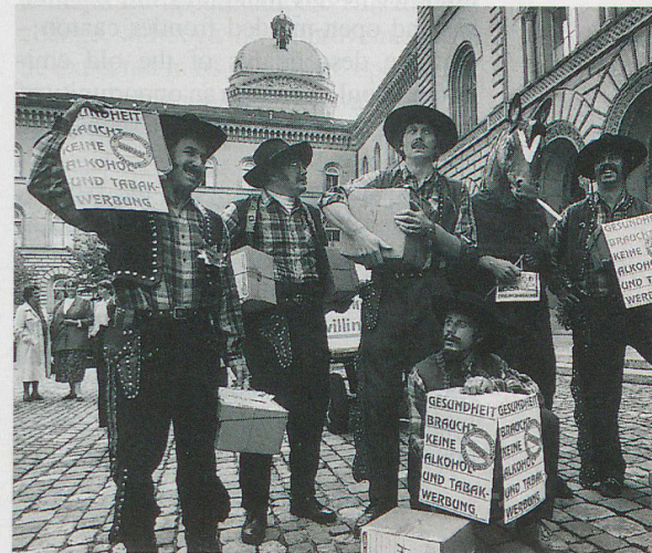
Tobacco and alcohol advertising damages public health, or so said the initiators as they handed in their list of signatures.

In addition, doubts are manifested as to the benefits for public health if an advertising ban is passed. The government also makes the point that even if the initiatives were accepted, tobacco and alcohol advertising would continue to be present in foreign publications sold here, and on foreign radio and TV stations. A ban would disadvantage not only domestic producers of alcoholic beverages, it would also hit newspapers and magazines who profit considerably from alcohol and cigarette advertisements. The government and parliament maintain that the negative consequences of an advertising ban outweigh the understandable but disputed alleged positive effects towards lower alcohol and tobacco consumption. They also add that total advertising bans do not fit into