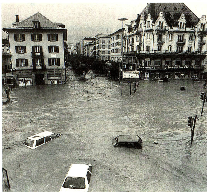
The weather disaster in Brig had devastating consequences.

Weeks of constant rain have resulted in serious damage in many parts of Switzerland. In Ticino large areas of Sopraceneri were flooded and declared disaster zones. The towns of Locarno and Ascona were almost entirely under water after the surface of Lake Maggiore rose to record levels.