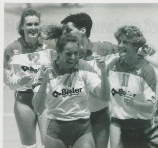
Reason to celebrate: the Swiss women's volleyball team...

Is it true that Switzerland is a worldwide leader in sport for the masses? I would very much like to hope so. I don't know what is going on in sport all