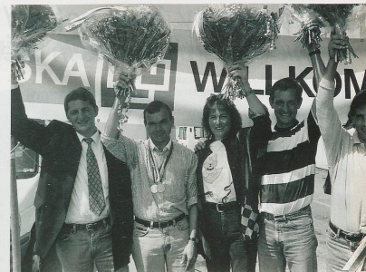
...and the same goes for the horse-jumpers.

tor sports. But of course we need more than that to bring our sportsmen and sportswomen up to the top professional level. An analysis has shown that in Switzerland today sport generates between 16 and 18 billion francs. Nowadays gym shoes are worn wherever people go, and not just for sport. Sport influences fashion, and it's mixed up in the hotel trade. So there is no harm in business making a substantial contribution, so that sport – which is used so much in advertising – continues to be promoted and encouraged to an ever greater extent.