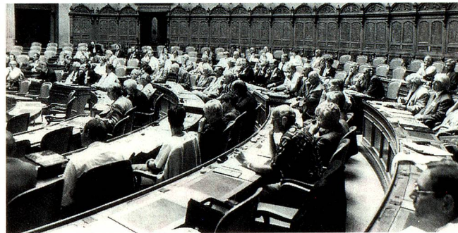
A well-attended meeting of the Council for the Swiss Abroad in the National Council chamber.

In the middle of its four-year period of office the Council for the Swiss Abroad met for its first public session in the Swiss parliament building. The dignified surroundings suited the important issues at hand.