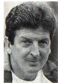
Another success for Roy Hodgson (inset) and the Swiss soccer team: European Cup qualification. An important milestone was Kubilay Türkyilmaz' 1:0 against Hungary last October.

After coming top in its five-nation group, the Swiss association football team has made it to the 8th European Cup which will be held in England from June 8-30. After qualifying for the 1994 World Cup this is its second big success within a short period. Before that Switzerland had not played in any international championship since 1966. Its team will be up against England, Scotland and the Netherlands. Those coming