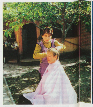
The improvised hairdressing salon in the courtyard of the OSCE mission in Grozny.

Geneva, Florence and most recently. Following the summit meetings in Geneva, Florence and most recently Vienna and your various visits to Sarajevo, you have now given the green light for elections in Bosnia. Was this a difficult decision? I would certainly say so. The minimum guarantees for maintaining the principles of freedom, correct behaviour and democracy mentioned in the peace agreement are the essential conditions for carrying out elections. The country presiding over the OSCE was called upon to decide whether these conditions