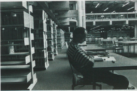
Specialised universities to open in 1997