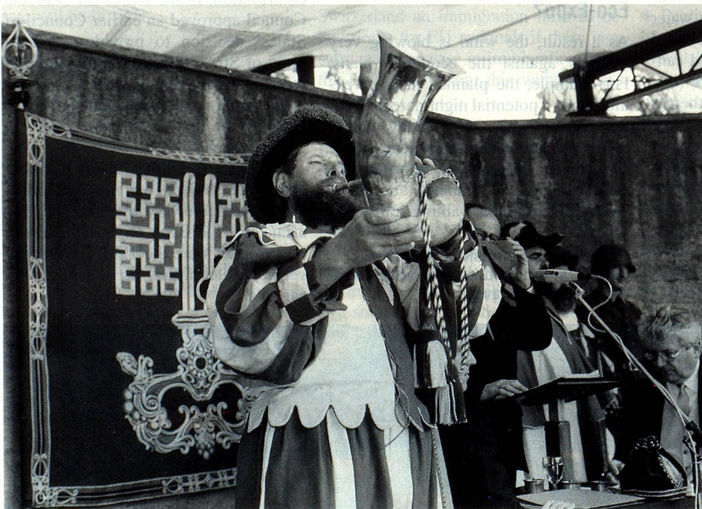
This picture belongs to the past. The Lower Unterwalden Landsgemeinde has served its purpose.

The rather low voter participation of 47% showed that even in Lower Unterwalden discussions about the Landsgemeinde did not generate that much interest. Landsgemeinden will still be held in both Appenzell half-cantons, as well as in Glarus and Upper Unterwalden. ■