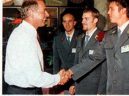
Federal Councillor Ogi being greeted by Swiss Abroad recruits.

taken on in 1972 as a bookkeeper, she has been