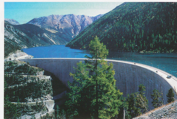
Hydro-electric power continues to play a major role in Swiss energy production: Punt dal Gall reservoir in the Engadine.

There really are no valid arguments against efficient and careful use of energy. But in times of very weak or zero growth the economy must be able to keep on functioning. With its 'Energy 2000' action programme, the Federal Council provided an appropriate follow-up to the referendums of September 1990 and at the same time set the points