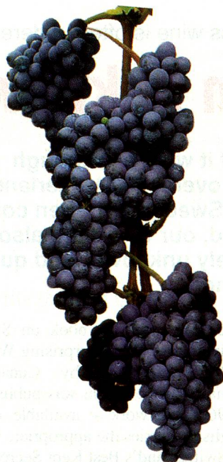
Pinot Noir – a typical Swiss grape.

Swiss wines are a mirror of the legendary Swiss diversity. The highest repu-