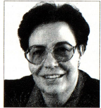
Yvette Jaggi: a leader in the fight against male dominance in politics.

Equality. Well qualified as a politically active woman, becoming mayor of Lausanne, she points out the obstacles women still have to overcome in a historically male-dominated society.