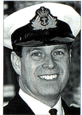
The Duke of York, a serving officer in the Royal Navy, has agreed to meet the school fees of almost £40,000 a year.

None of this comes cheap for pupils' parents. Aiglon's fees come to £19,500 a year, which means that Prince Andrew, who has agreed to meet the princesses' school fees, will have to find almost £40,000 – a hefty slice out of his naval officer's salary.