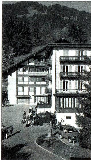
Aiglon College: Its suitability for the princesses has already been considered by the Queen at Buckingham Palace

Fortunately the Royal Family never stint on the cost of education for the young princes and princesses. The Duke has already talked to the Queen about the benefits of Aiglon.