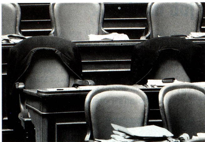
In 1999 the seats in the National Council will be redistributed.