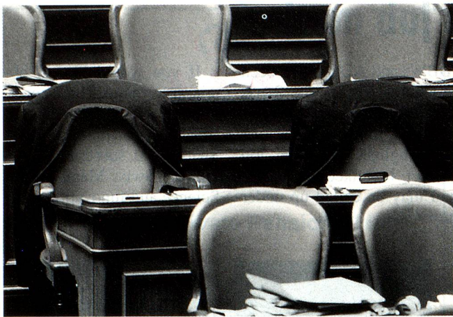
In 1999 the seats in the National Council will be redistributed.