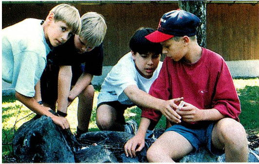
The summer camps in Switzerland for Swiss Abroad children and young people promise sports, games and fun.

In 1999 the Foundation for Young Swiss Abroad will once again be organising summer holiday camps in Switzerland for youngsters between the age of 7 and 14. If asked, the Foundation is prepared to consider a reduc-