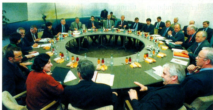
The round-table discussions contributed to the long-term reduction in government budget deficits.

While the positions in the left and right camps are clear, two factions have emerged in the centre parties: one on