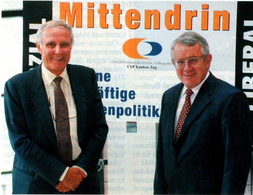
Retiring Federal Councillors Cotti (l) and Koller (r).

Both were elected twelve years ago. Now CVP Federal Councillors Arnold Koller (65) and Flavio Cotti (59) are both to retire on 30 April 1999. This unexpected double vacancy frees the path for a second female Federal Councillor.