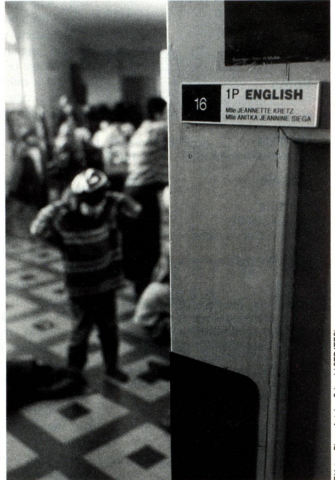
The promotion of English at an early school age is causing heated debate...

School authorities, parents and children are instead turning more and more openly towards English. In a world that marches to the beat of commerce, English appears to be the only foreign language with market value. French and Italian-speaking Switzerland views this trend as the logical conclusion of a fatal development. The widespread use of dialect throughout German-speaking