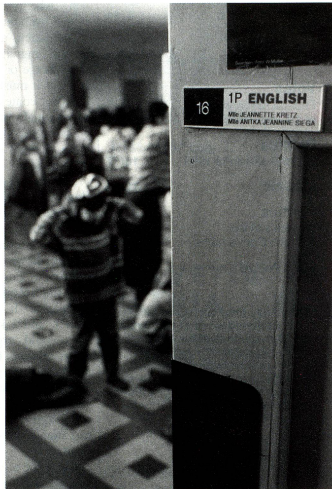
The promotion of English at an early school age is causing heated debate...

School authorities, parents and children are instead turning more and more openly towards English. In a world that marches to the beat of commerce, English appears to be the only foreign language with market value. French and Italian-speaking Switzerland views this trend as the logical conclusion of a fatal development. The widespread use of dialect throughout German-speaking