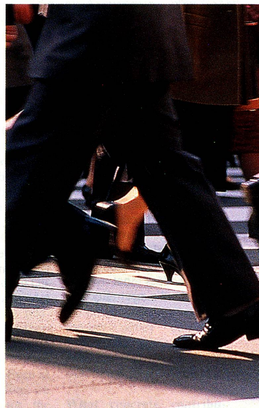
The gradual transition to free movement of people is increasing the mobility of those in employment.

grounds of involuntary loss of employment, illness or accident. Swiss Abroad are entitled to return to the EU at any time.