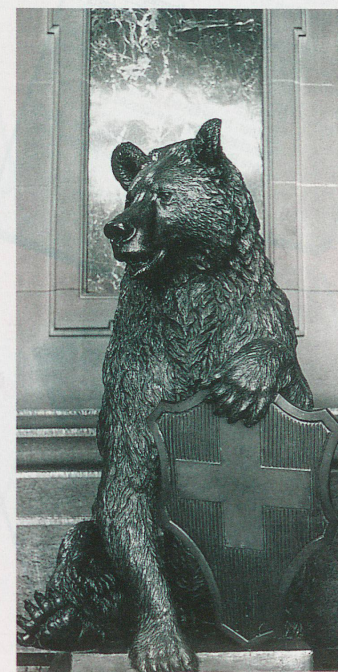
Political as well as wild animals lock horns in parliament.

It is unlikely that the consensus system will be replaced by a purely competitive system. The latter is alien to Switzerland's political culture and is difficult to blend with direct democracy. One possible solution would be the formation of a parliamentary majority with a shared legislative programme.