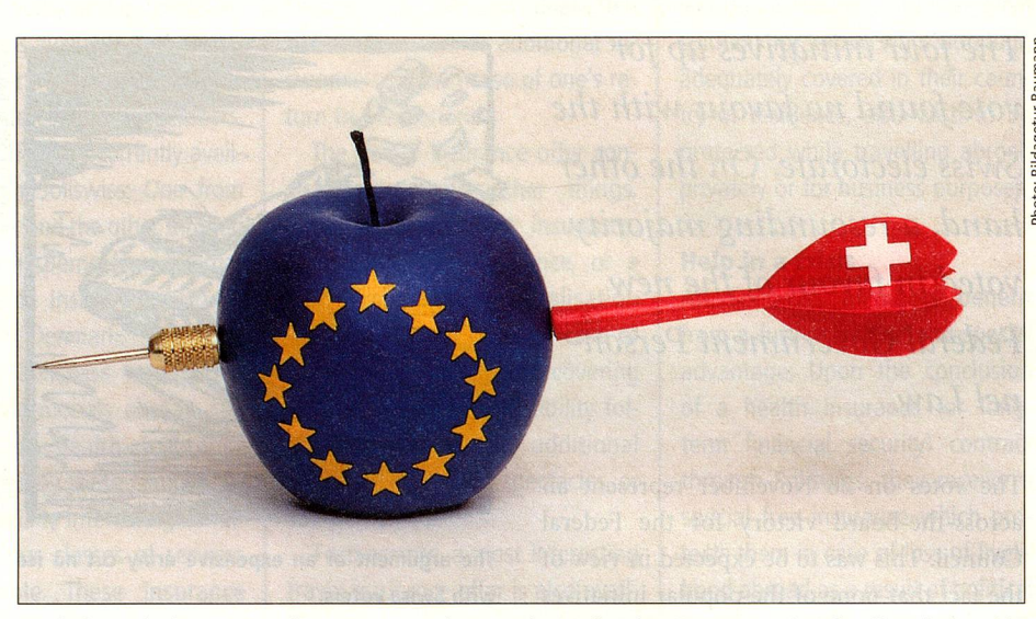
Mythological elements will once more play a role in the decision on Switzerland's relationship with the EU.

Voters will be invited to cast ballots on three initiatives on the next federal referendum date. The central theme is Swiss policy on Europe, with the "Yes to Europe!" initiative. The electorate are also asked to vote on a proposal to introduce a 30 km/h limit in built-up areas and an initiative to lower the price of medicines in Switzerland.