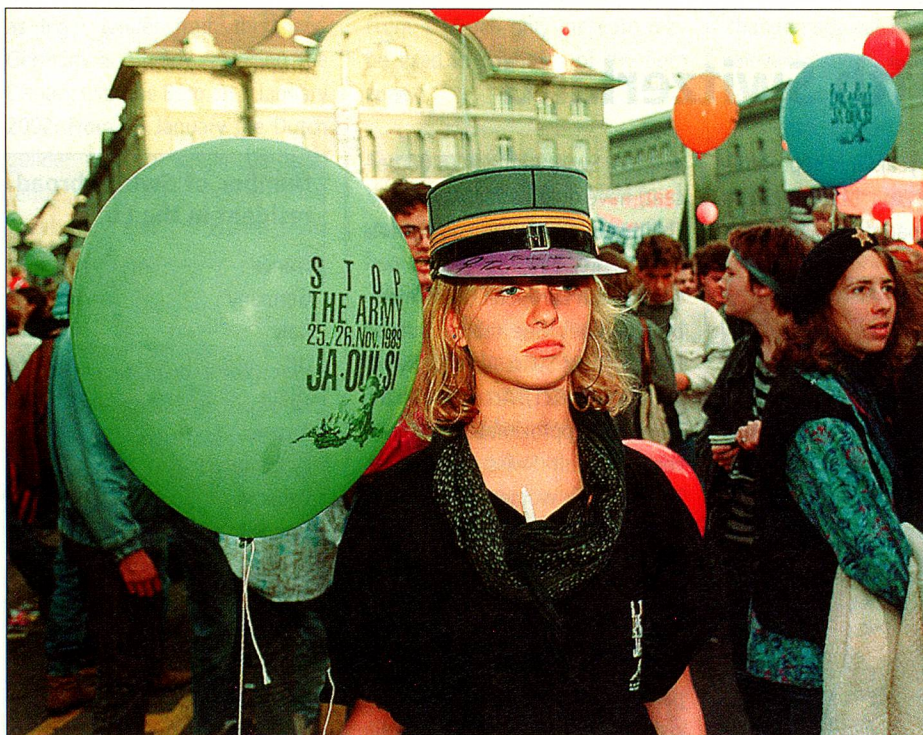
"For a credible security policy and a Switzerland without an army": opponents of the army collected 110 000 signatures for their popular initiative.

While this initiative is no less radical than the one rejected by voters in 1989, it would leave a door open to the possibility of armed international peace missions. As far as Swiss security policy is concerned, it would require a complete reformulation. "By bringing issues such as equal opportunity, environment, social justice etc. into play, it has been given a social policy dimension. A security policy of this type is aimed at a