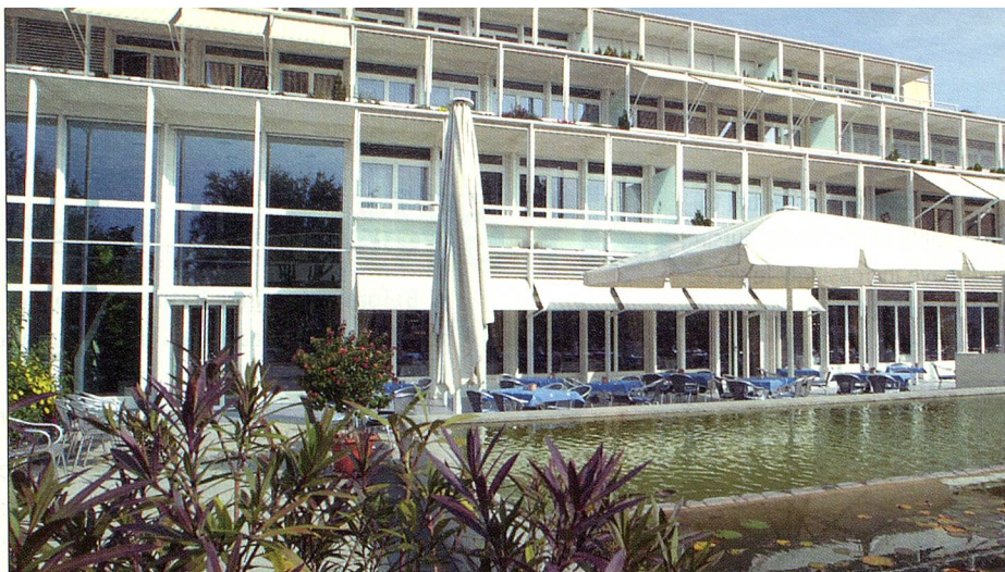
Luxury end of the market for a discerning clientele: The Park Residence Meilen