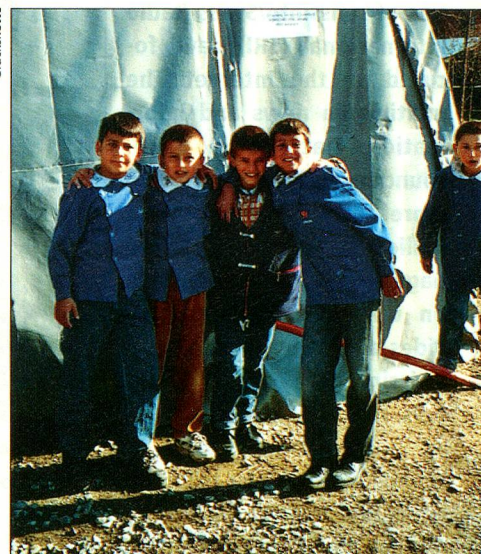
Swiss Solidarity provided 26,000 children with temporary classrooms after the earthquake in Turkey.

way of informing you once or twice a year about how the donations were spent.