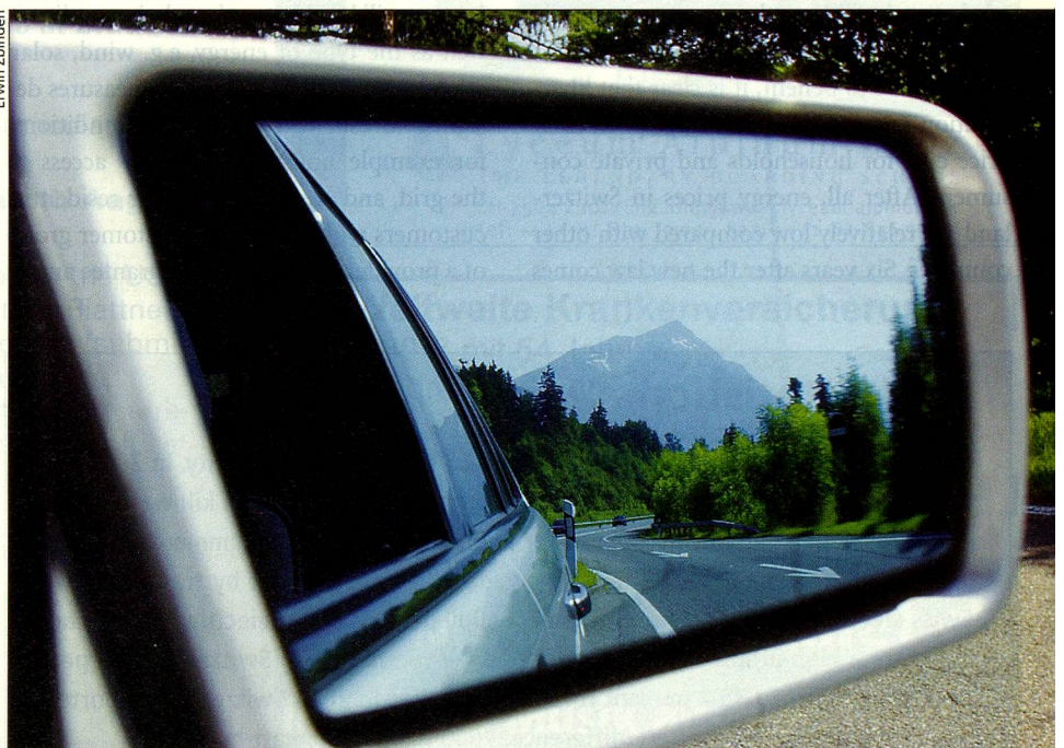
The mountain reflected by the modern world.