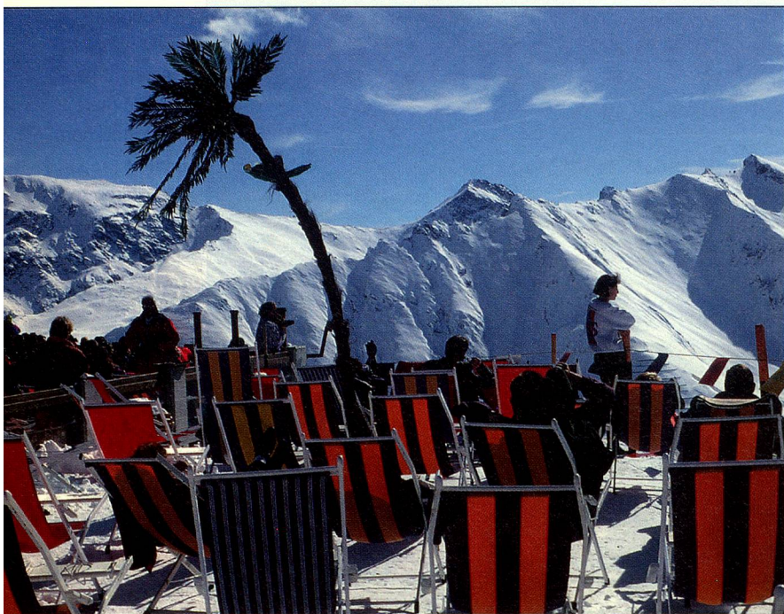
From natural phenomenon to consumer product.