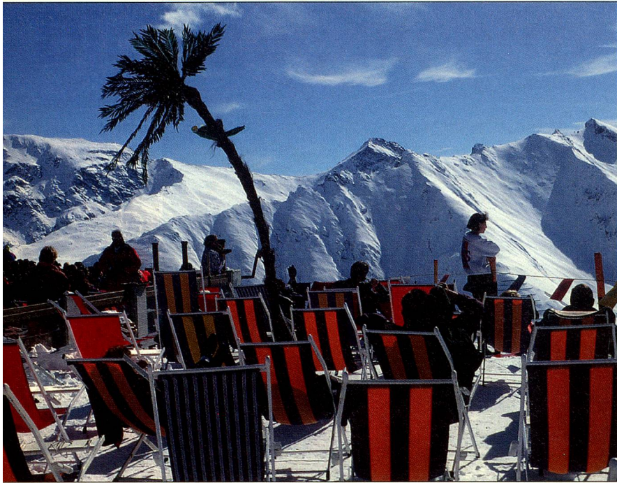
Gesellschaft für ökologische Forschung/Sylvia Hamberger

From natural phenomenon to consumer product.