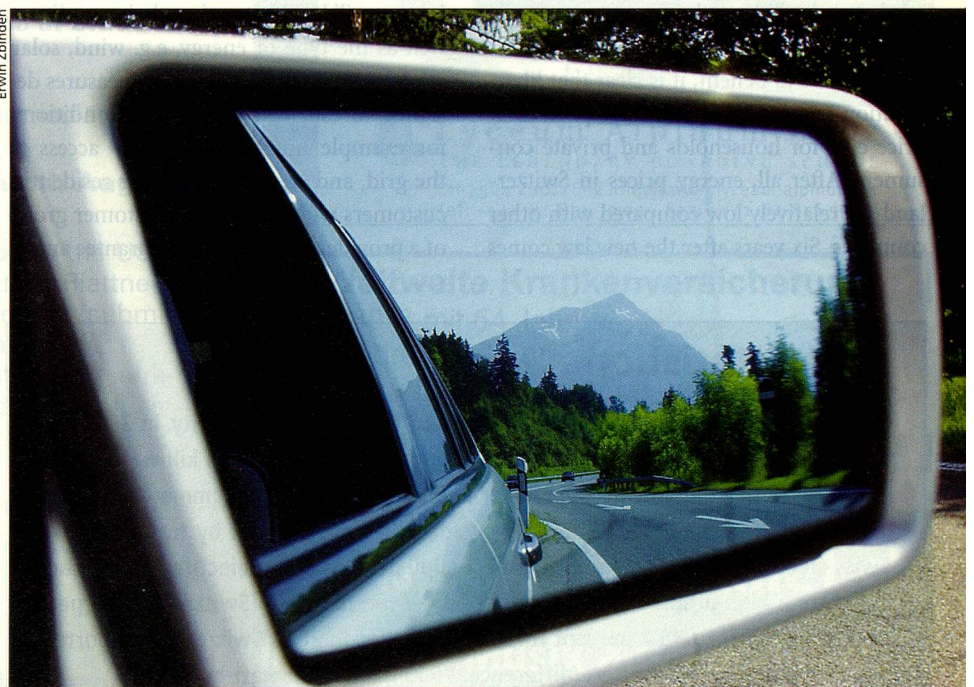
The mountain reflected by the modern world.