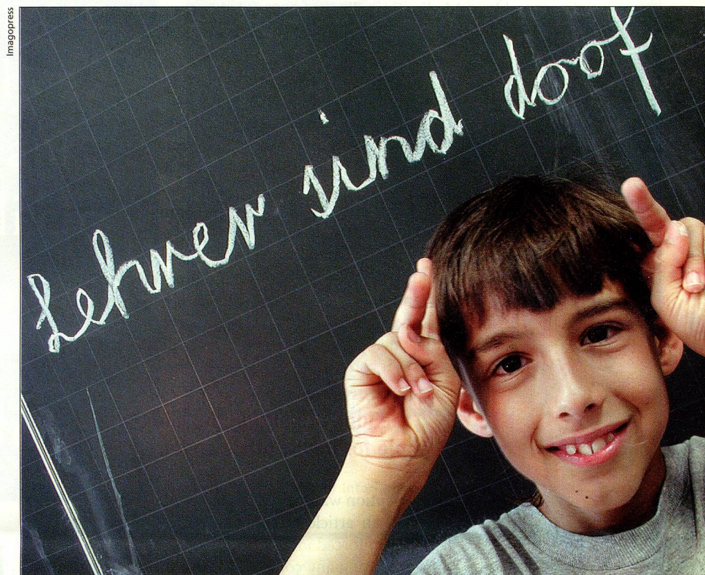
Little rebels can also be lovable. The situation becomes critical when rebellion turns into violence.

Some cantons fare better than others in the study, but overall Swiss schools appear to be incapable of "correcting socio-cultural inequalities", according to Swiss PISA experts. While this study is certainly the first of its kind and comparable statistics have still to be compiled, the results of tests conducted on young Swiss as part of their military conscription evaluation confirm that school is not as efficient as it should be for the neediest students.