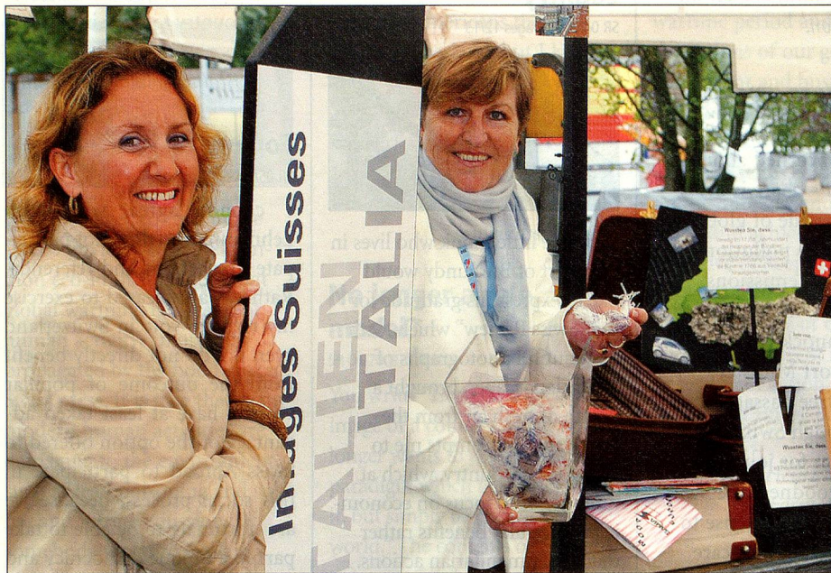
Radiant Swiss Abroad at the "Images Suisses" Italy stand.

On 10 August the Organisation for the Swiss Abroad held its Swiss Abroad day under the motto "Images Suisses" as part of the Expo.02 National Exhibition. Over 14,000 visitors took the opportunity to find out about the Fifth Switzerland. Statistically, one in two Swiss visited Expo.02. In