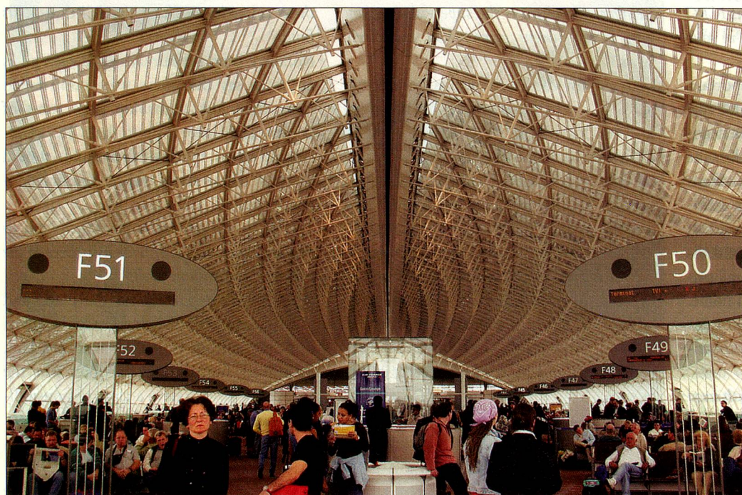
Departure lounge in Charles de Gaulle Airport, Paris.

If you are looking for accommodation, you should contact a real es-