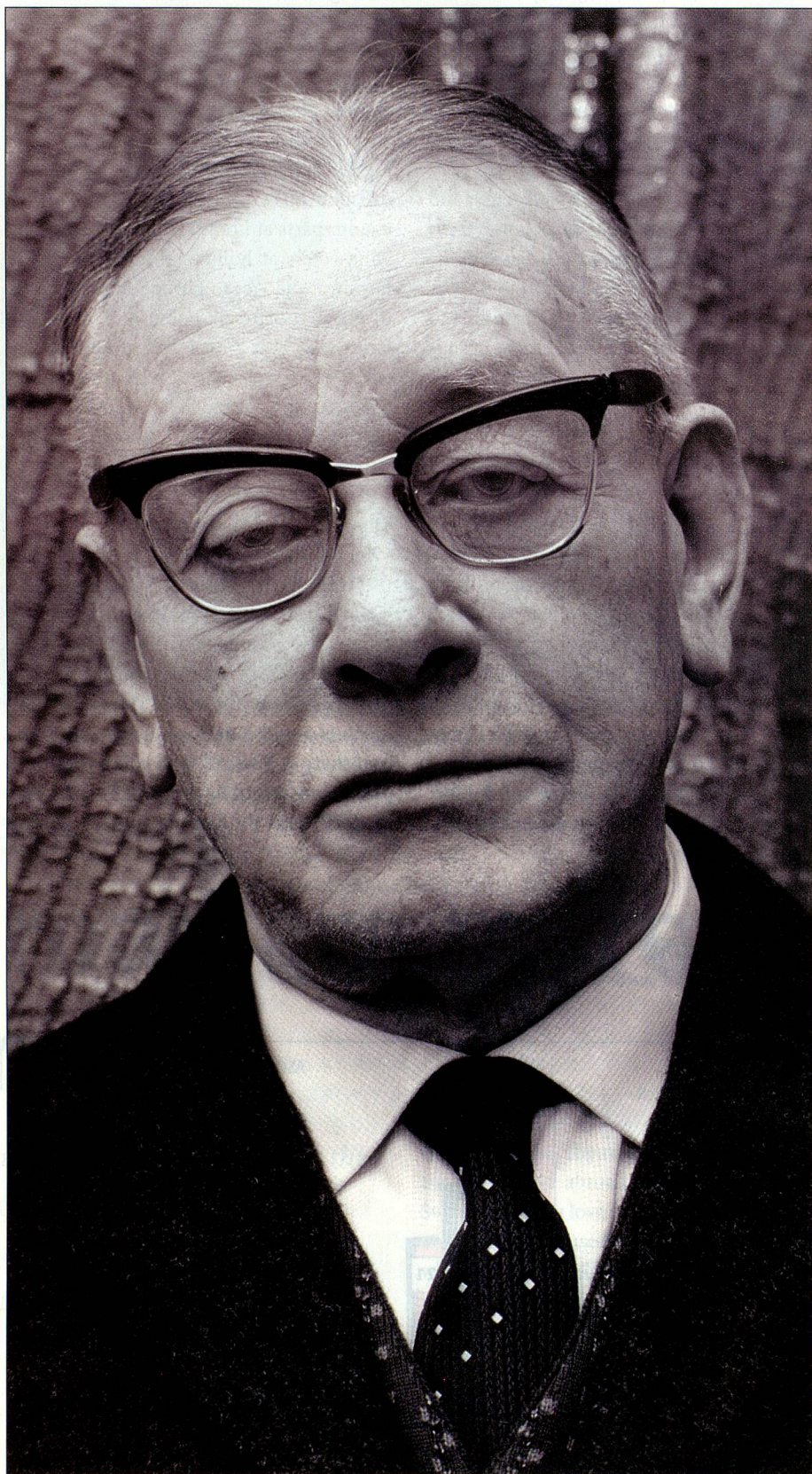
Paul Grüninger, the St. Gallen police chief who in 1938/39 allowed Jewish refugees to enter Switzerland in defiance of the regulations.

The best-known case of persons who were accused of crimes after saving the lives of thousands of Jews in 1939 was St. Gallen policeman Paul Grüninger, who was pardoned only in 1996 by the St. Gallen district court. In 1939 Grüninger was summarily dismissed and in 1940 was found guilty of dere-