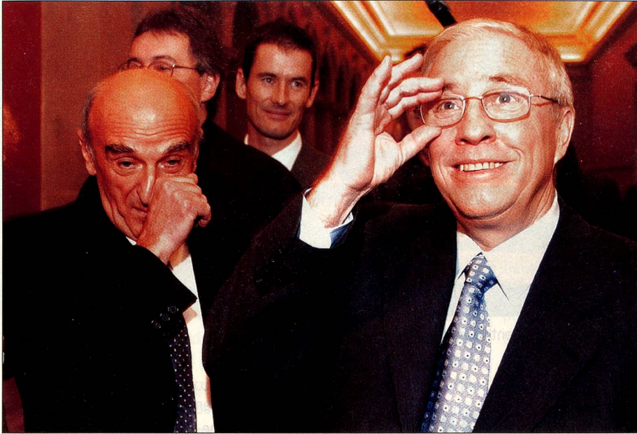
As Christoph Blocher (right) blinks in the limelight, Hans-Rudolf Merz wipes away a tear.

Democratic centrist Christoph Blocher and radical Hans-Rudolf Merz are the new faces in the Federal Council, which was elected on 10 December. By choosing a second UDC member to replace Christian Democrat minister Ruth Metzler, Switzerland's Federal Assembly has broken a political balance of 44 years' standing (see "editorial" page 3).