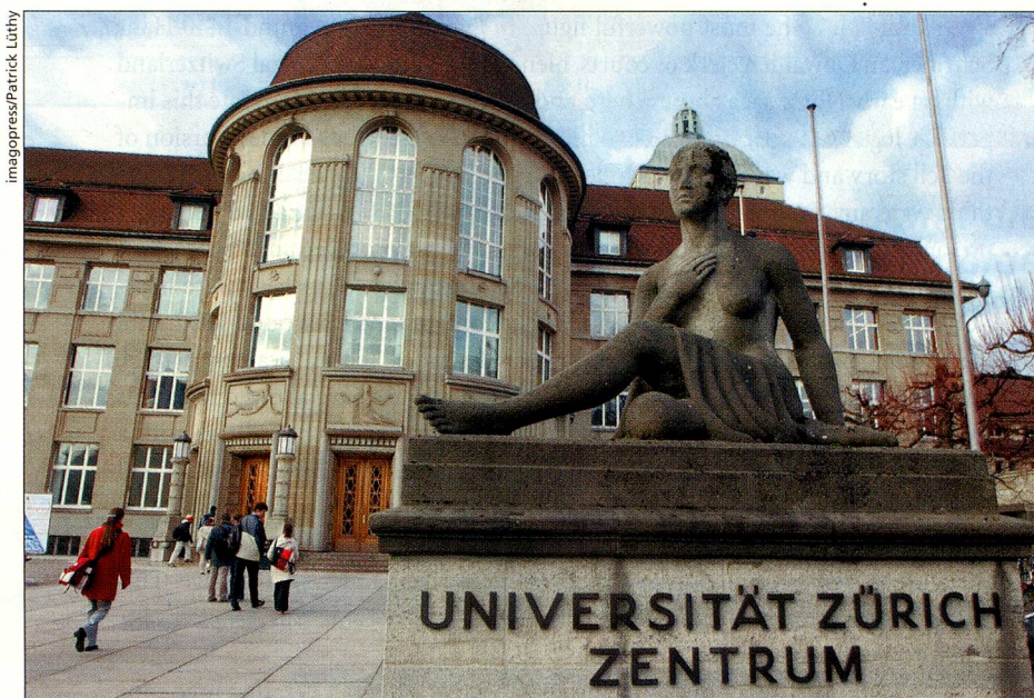
Swiss universities aim to facilitate mobility.