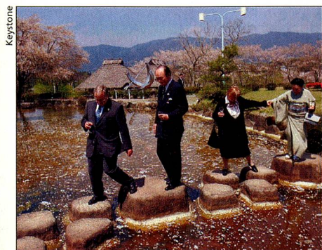
Federal President Schmid at the World Expo.

23 March. Opening of the World Exhibition in Aichi, Japan. Cultural Switzerland is not only content with the Swiss pavilion in the Land of the Rising Sun – since two years Pro Helvetia has been organising a rich cultural programme throughout Japan to present