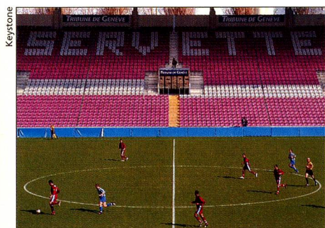
FC Servette Geneva facing bankruptcy.