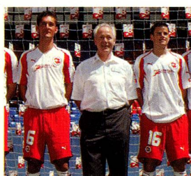
Köbi Kuhn, National Coach