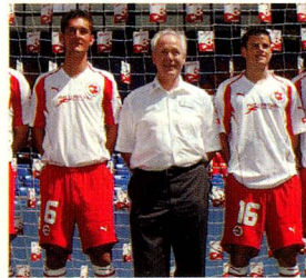
Köbi Kuhn, National Coach

We talked to national coach Köbi Kuhn, who is not only one of the best Swiss footballers of all time, but has also spent years successfully coaching young footballing talents in Switzerland. Talented young male and female Swiss Abroad (yes, the SFA also runs a training centre for young female footballers) who think they have what it takes to play for a junior national team, should contact the SFA in Berne as soon as possible to find out about the terms and conditions. Who will be the first Swiss Abroad to play in the Swiss national football team in a few years' time?