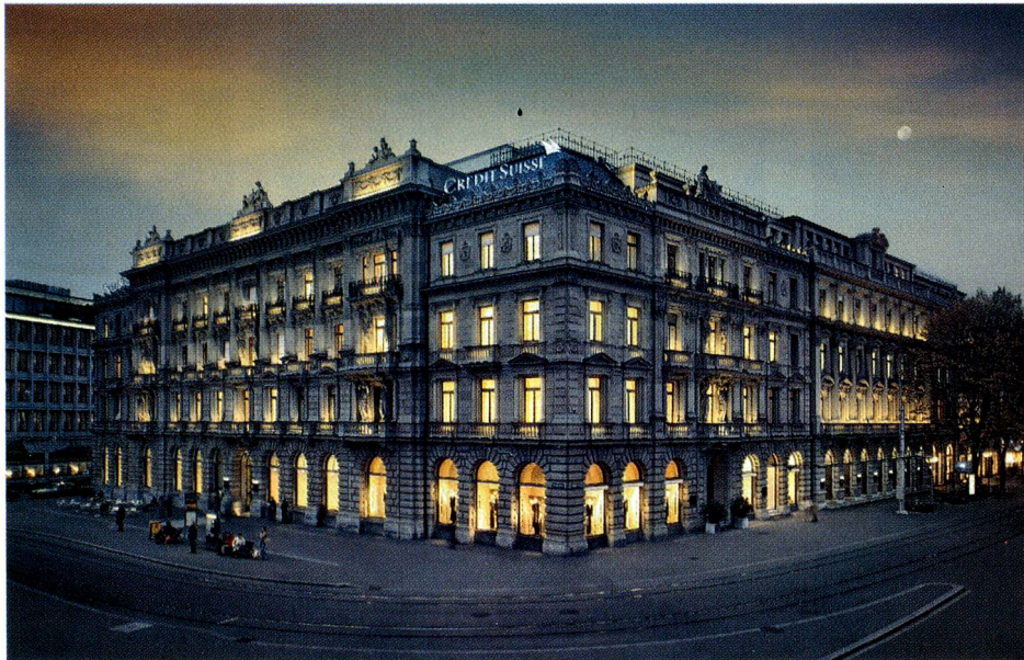
Global Player Credit Suisse: Head office at Paradeplatz, Zurich

Even more impressive than the annual direct investments is the amount of capital stock built up abroad over a century. At the end of 2004, the stock of direct Swiss investment abroad amounted to more than CHF 448 billion, of which CHF 159 billion was in the industrial sec-