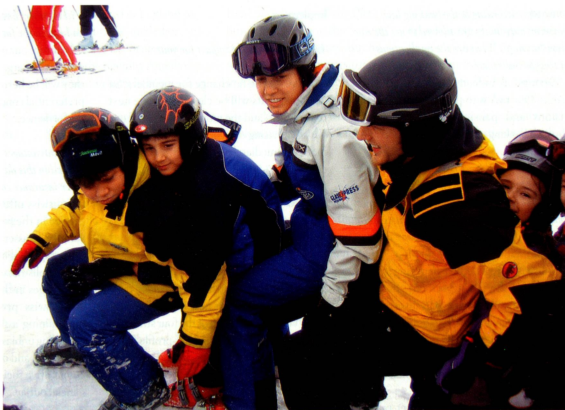
FYSA winter camp in February 2006.