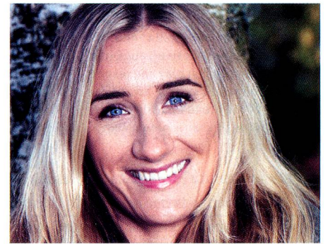
Tanja Frieden, Olympic boardercross champion