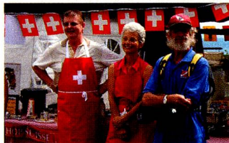
Fraser Coast Cultural Festival 07 (Qld)