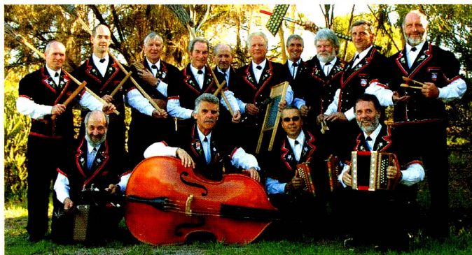
The Swiss Yodel Choir Matterhorn from Melbourne ready for the launch of their CD

Phone: (07) 3899 8996, or email to: mgodat@off-ice.com.au