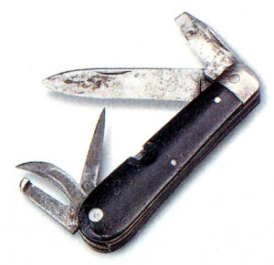
The first Swiss army knife, manufactured by Victorinox. The first shipment was made in 1891.