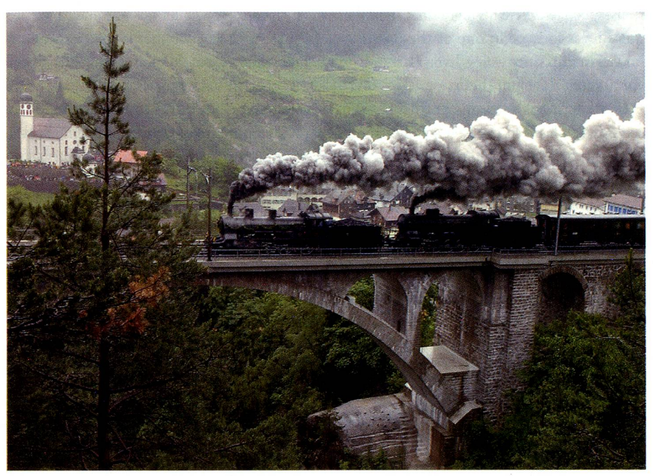
An historic train combination puffs its way across the Wassner viaduct on the line between Erstfeld and the Ticino on 1 June 2007, the 125th anniversary of the Gotthard railway.