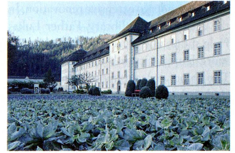
The monastery is self-sufficient