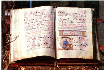
A manuscript from the library