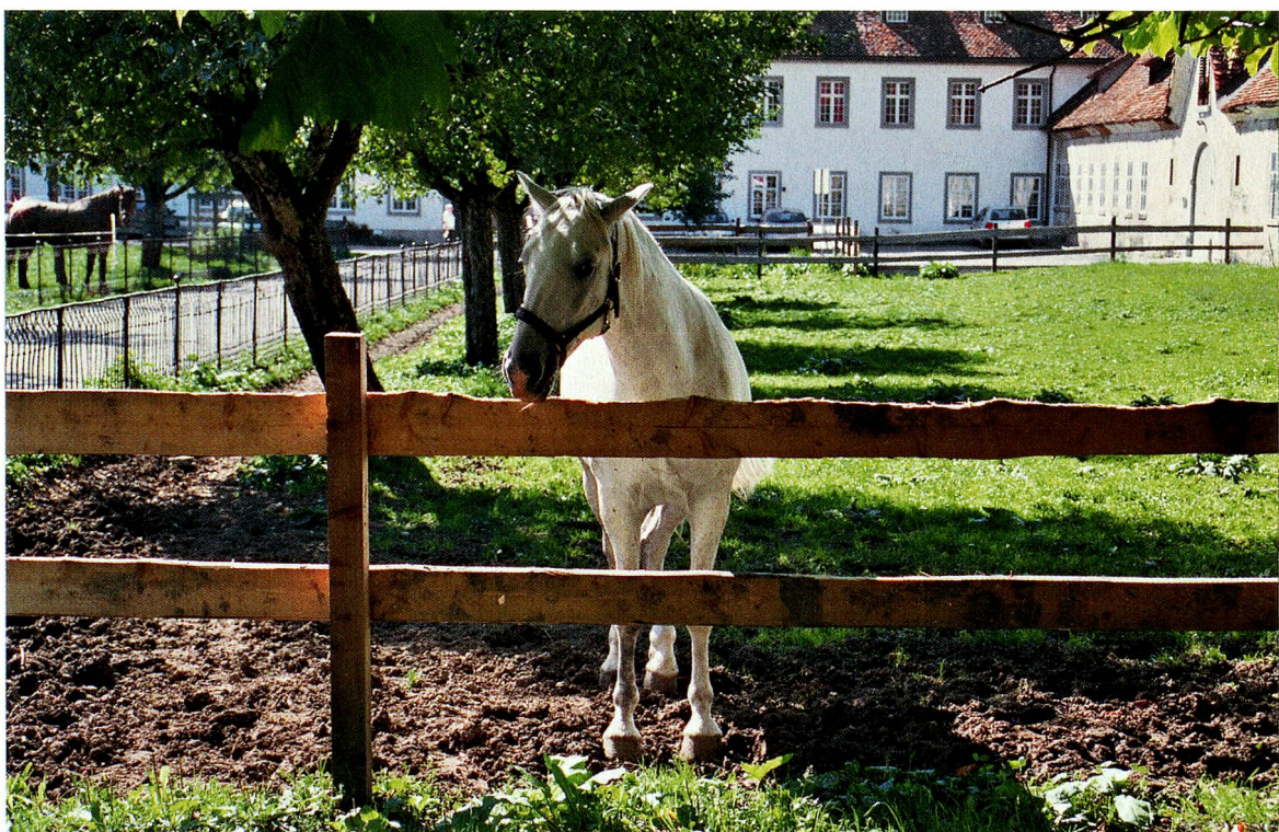
The monastery's stud farm is considered the oldest in Europe

complete renovation, so the carpenters, locksmiths, bricklayers, painters and other craftsmen at the monastery's workshops have plenty to do. The renovation is due to be finished in 2008. The stud farm is run by an experienced horse-breeder and her four stable hands, who look after the horses and give riding lessons. A vet visits the animals several times a week. Over the course of its thousand-year history, the Einsiedler has been crossed with various other breeds, though the sporty character of this wonderful horse, whose historic roots stretch all the way back to the 10th century, has always shone through.