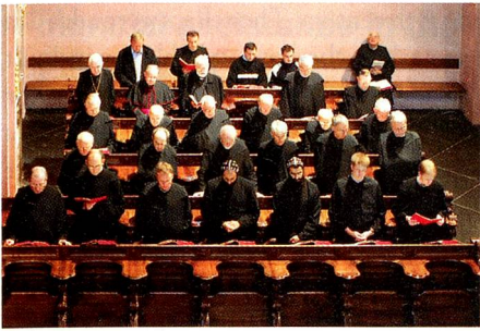
Monks at prayer