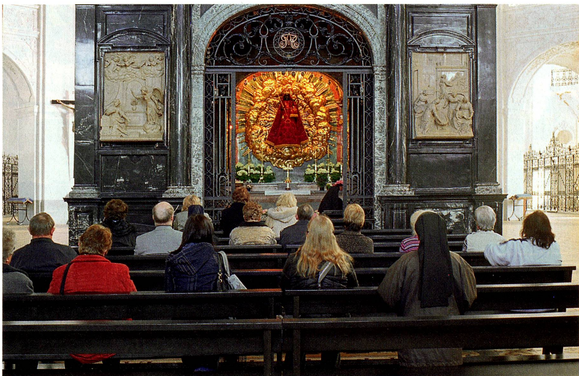
The sight pilgrims come to see: Einsiedeln's black Madonna in the baroque church