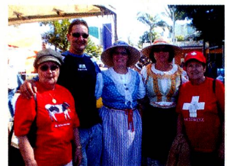
Bundaberg Multicultural Festival