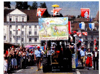
Swiss Yodelers of Sydney in Luzern