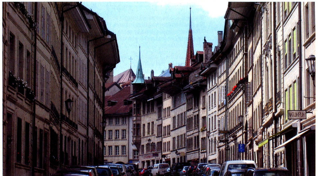
This year's ASO Congress was held at Fribourg