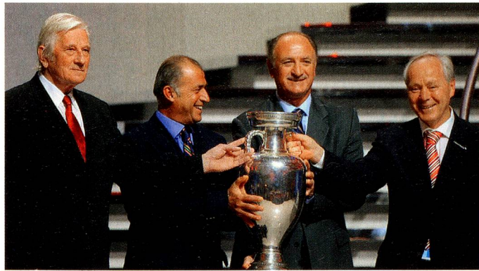
EURO 2008 DRAW: The coach of Switzerland's national soccer team Jakob "Köbi" Kuhn, Portugal's coach Felipe Scolari, Turkey's coach Fatih Terim, and Czech coach Karel Brueckner, from right, hold the trophy during the Euro 2008 final draw in Lucerne, Switzerland, on Sunday 2 December, 2007.

The final countdown has started. The Swiss team now knows who it will face in the