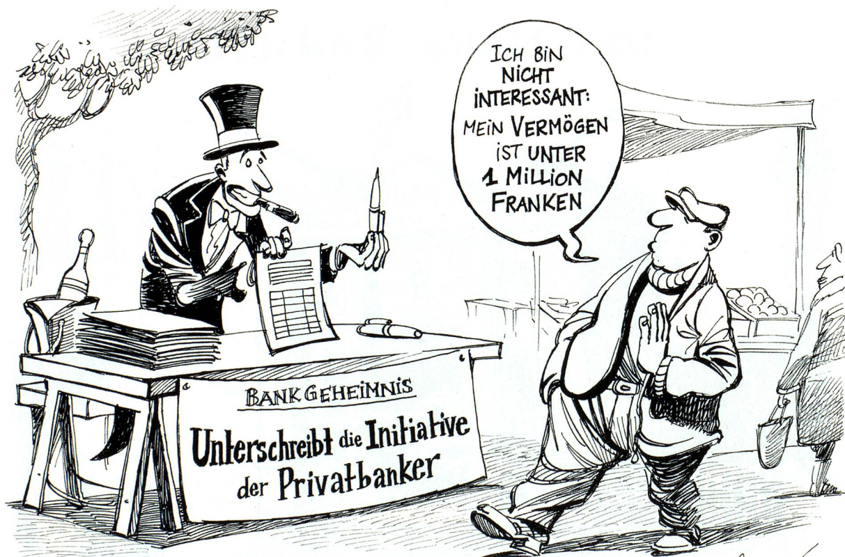
Banking confidentiality: sign the private bankers' initiative I'm not important – my assets are worth less than CHF 1 million.