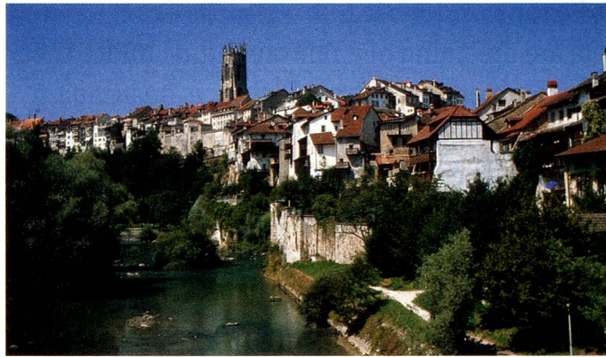
The next Congress of the Swiss Abroad will be held in the beautiful city of Fribourg.

Swiss accession to the Schengen area is a big issue for the Swiss abroad. What would happen to Switzerland if it opened up its borders and discarded border controls? What if it isolated itself from Europe? There is actually going to be an optional referendum on the definitive introduction of the free movement of people. The 670,000 or so Swiss residing abroad are following developments at home with a close eye. Working across borders, being a foreigner and looking for work as a foreigner are all issues that the congress participants will be familiar with from their own