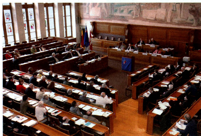
... was the venue for the meeting of the Council of the Swiss Abroad.