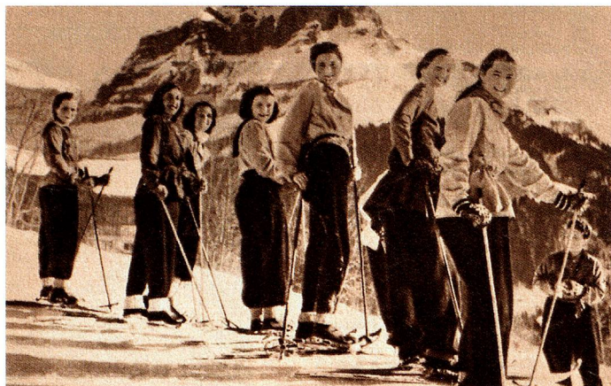
Ski camps, past and present: Engelberg 1942